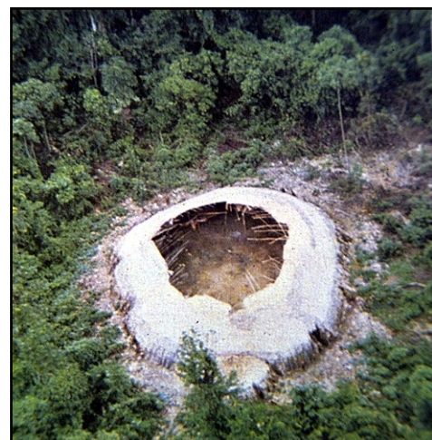
Lived in a village like this for a year...