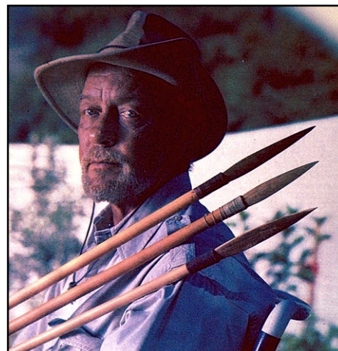
Napoleon Chagnon (a cool guy)...

These types of research offer virtually no control but can be used to obtain rich descriptive information on which formal theories can be based, and can be used to obtain specific kinds of information to test