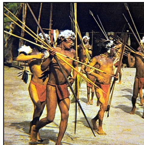
With people like this.